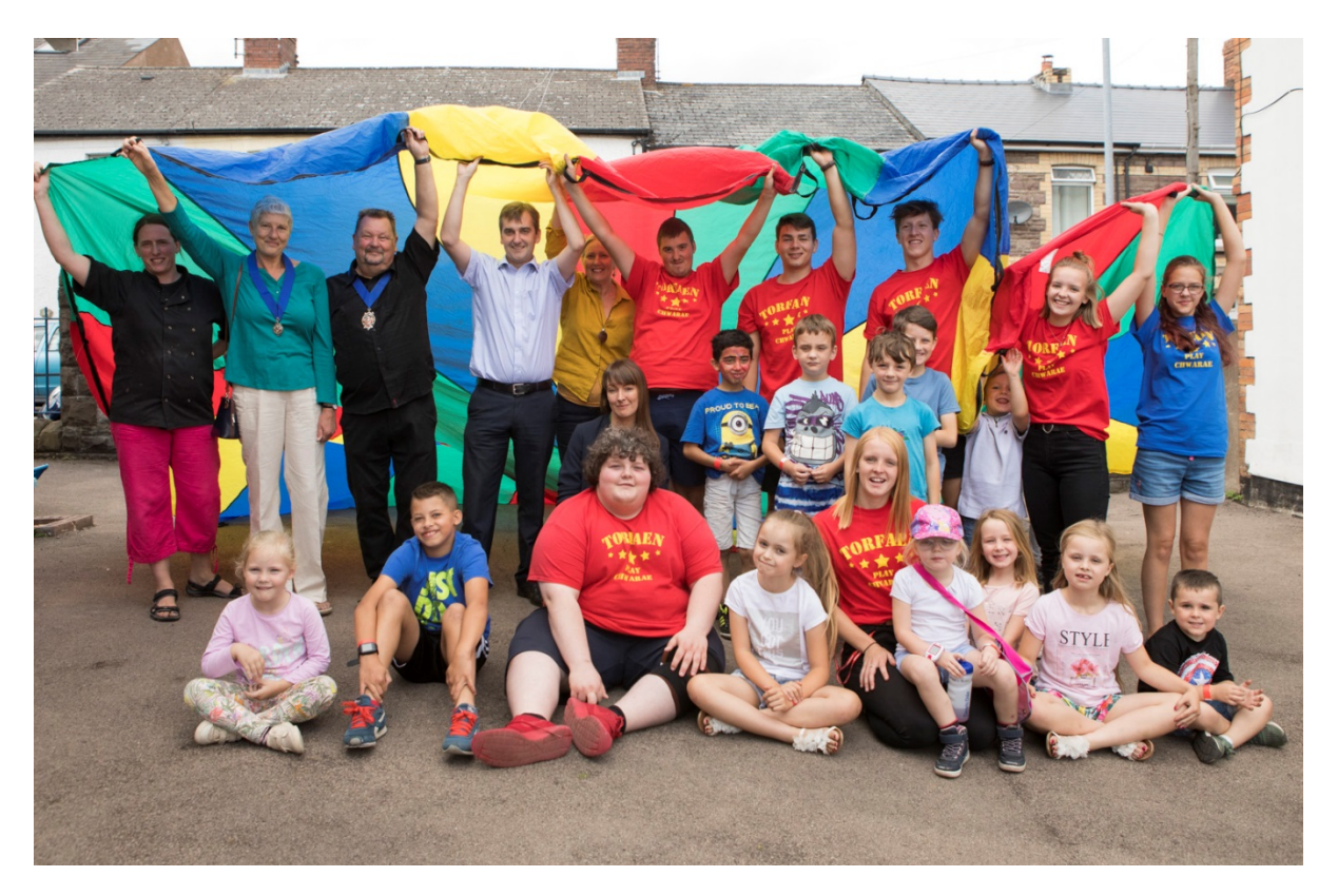
Celebrating National Play Day at Abergavenny Community Centre on 1st August 2018

The play helper project has been running successfully in Torfaen for the last ten years. It is the pre-volunteering stage of the summer initiative. Young People aged 13 - 15 years have to apply via an application form and they also have to complete an induction and attend an interview. Their role is to work as part of a team and learn new skills. This year was the first year we had a play helper based in Monmouthshire. It is anticipated that those who are a play helper will then go on to volunteer and then achieve play worker status when they are old enough. For the summer of 2019 we will be trying to support all the play helpers to achieve an accreditation too.